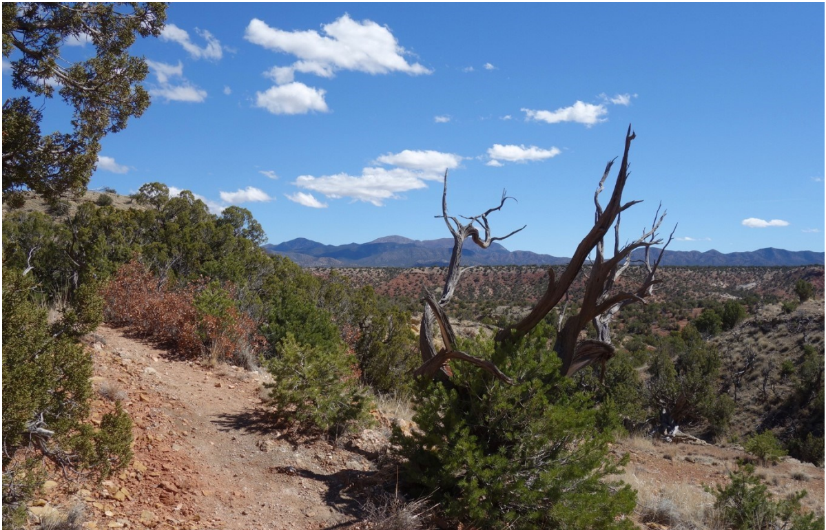
Golden Open Space