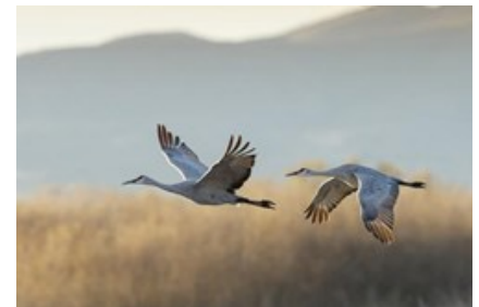
Sandhill Cranes Stock photo

Plant life abounds along the Rio Grande. The river is the foundation but the Rio Grande Cottonwood is the anchor of the Bosque, and other trees and shrubs live scattered throughout the landscape. There is a host of different species like Russian Olive, Saltcedar (Tamarix), Siberian Elm, Russian Thistle (Tumbleweed), native Goodding, Peachleaf willows, New Mexico olive, Coyote Willow, False Indigo, and Seepwillow. There are various grasses and aquatic plants that provide a seasonally ever-changing habitat and hideaway for the many critters found throughout the Bosque ecosystem.