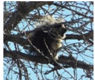
Porcupine Photo by Colleen Hartwell (Shackley)

Albuquerque’s Bosque is a home for up to 250 species of birds from the majestic Sandhill Crane (pictured), to the mini powerhouse Black-Chinned Hummingbird. The Bosque harbors a wide variety of mammals: the reclusive Porcupine (pictured), often observed slumbering in the Cottonwood canopy; the skittish Coyote; and even an occasional Beaver leaving trailing wakes on the River’s surface. The list of critters that make the Bosque their home is much too long to be included in this short article. You’ll just have to explore this riverine forest yourself to see the wide variety of flora and fauna...so mark your calendars and join your fellow explorers on the Bosque Wild: Guided Nature Walk.