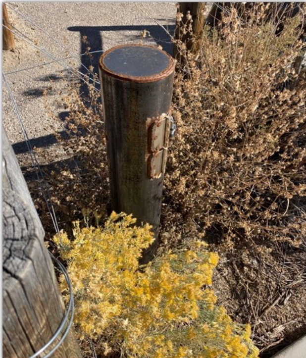
Trail counter in protective metal encasing.

It took some time and a lot of hard work by the OSD to install the trail counters from our 2018 REI grant. The OSA split the cost of 18 trail counters with REI. All of the REI grant-funded counters are installed in the Foothills. A special thanks to the National Park Service folks over at Petroglyphs for their help with the counter housings.