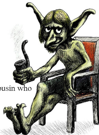
Local guest contributor to your most reliable source of fake Open Space news

When El Duende isn't doing zoom meetings or Public Service Announcements, he's been passing the "stay at home" hours by binge watching his favorite movies with a growler of his favorite local beer. El Duende would like to share some of his favorite movies with you. Not many people know this, but El Duende is a big fan of the Harry Uffda series. If you are not familiar with the Harry Uffda series, they are about a boy Duende who is orphaned at a young age and raised by a mean aunt, uncle and cousin who make him live in a closet. On his 11 th birthday Harry gets an invitation to attend Onionwarts School of Trail Building and Erosion Control. The story follows the boy Duende as he hikes down Trail 140 3/4 to head off to Onionwarts where he meets Hermione Stranger and Ron Ferretly who become his best friends.